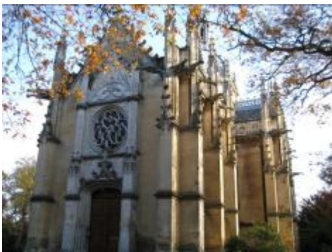
St. Michael's Abbey

The Abbey of St Michael is set in superb grounds at Farnborough on the Surrey/Hampshire border. The Abbey is a treasure trove of faith, history and architecture. The Empress Eugenie, widow of Napoleon III, crushed by her exile from France, and the loss of her husband and only son, the Prince Imperial, who had been killed while with a British expeditionary force in the Zulu War, commissioned a Mausoleum and a Monastery at Farnborough in their memory. It was to be both a witness to the presence of God and to the history of France. After more than a century St Michael's Abbey remains a place of prayer and pilgrimage. In accordance with the Benedictine tradition the community welcomes guests and visitors. Applications to stay at the monastery should be addressed